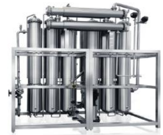
WATER FOR INJECTION GENERATION PLANT